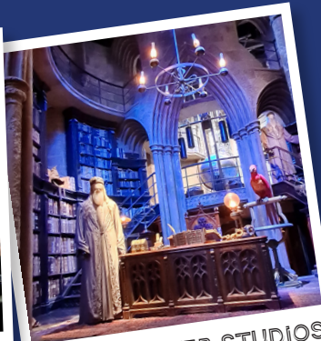
HARRY POTTER STUDIOS