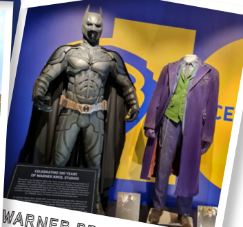
WARNER BROS. STUDIOS