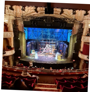
WEST END THEATRE